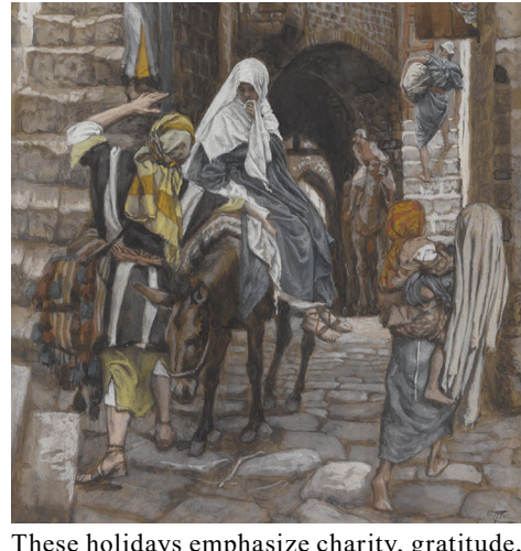
These holidays emphasize charity, gratitude, and devotion.

Eid al-Fitr and Eid al-Adha are significant Islamic holidays. Eid al-Fitr marks the end of Ramadan, a month of fasting, prayer, and reflection, while Eid al-Adha commemorates the willingness of Prophet Ibrahim (Abraham) to sacrifice his son in obedience to God.